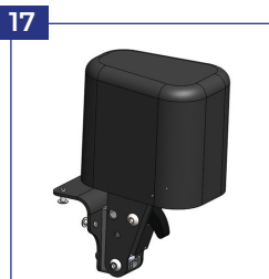
20 Abduction block