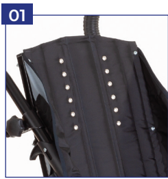
01 Reinforced nylon cover