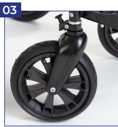
03 Plastic front forks