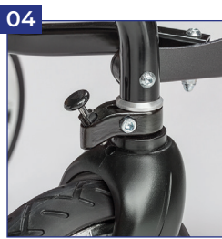
04 Swivel lock