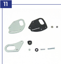
14 Tie down kit