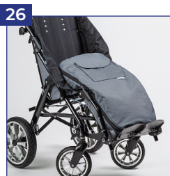
29 Winter warmer