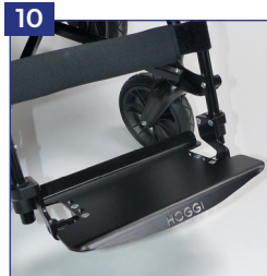
13 Foot board assembly straight