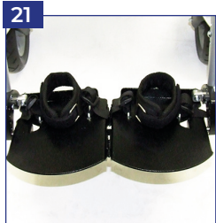
24 Ankle huger