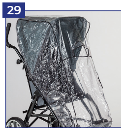
Canopy incl. transparent rain cover