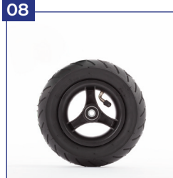
10 Pneumatic tires with 6-spoke rims