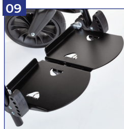
12 Foot board assembly