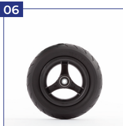
06 Polyurethan tires with 6-spoke rims