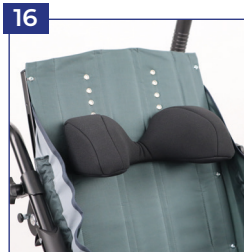
19 Anatomical neck headrest