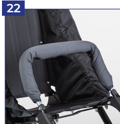
25 Crap rail with upholstery