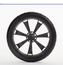
09 Polyurethan wheels with 7-spoke rims