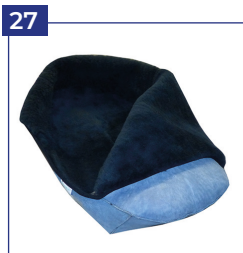
30 Sheep skin