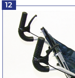
15 Attendant brake, two hand use