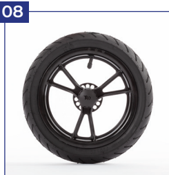
11 Pneumatic tires with 6-spoke rims