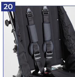
23 Five-point harness