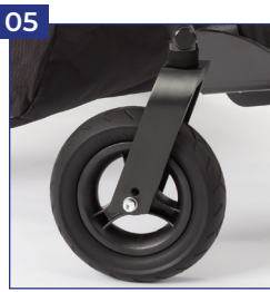
05 Aluminum front forks