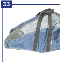
Nylon bag for transport