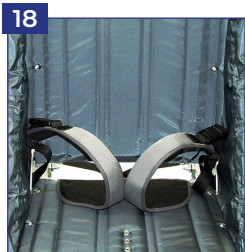
21 Groin strap