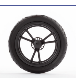
07 Polyurethan tires with 6-spoke rims