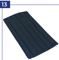
16 Back rest upholstery