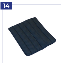
17 Seat upholstery