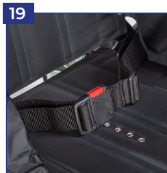
22 Lap belt