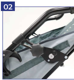
02 Recline angle extension 120°