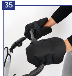
„Cosies“ Thermofleece hand warmer