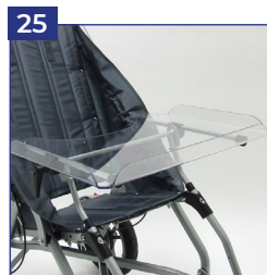
28 Therapy tray, transparent