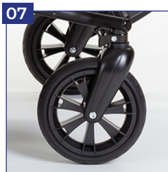
08 Polyurethan wheels with 7-spoke rims