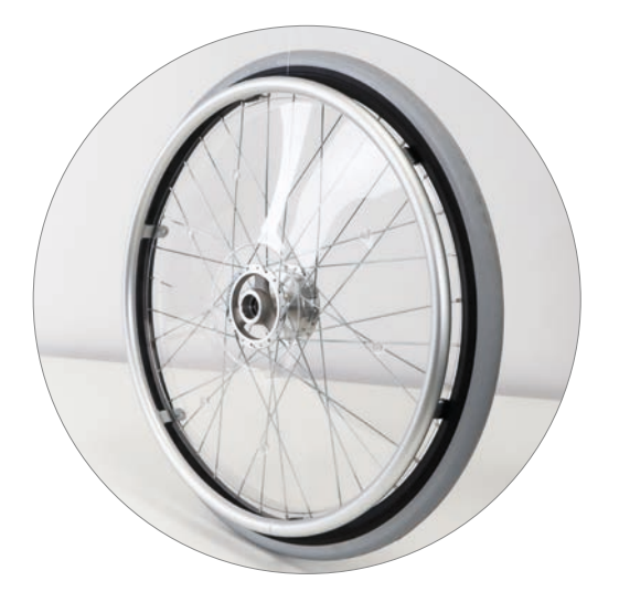
Drum brake wheel with transparent fastening clips

The HOGGI spoke guard is available for all HOGGI rear wheels in the sizes 22" and 24".