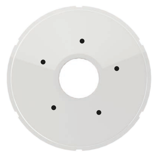
Spoke guard transparent on HOGGI light rear wheel 22"