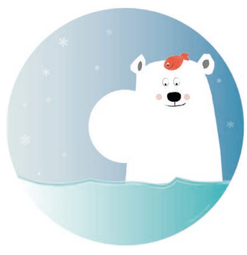
POLAR BEAR AVA