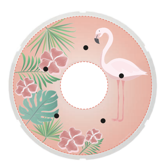
Print area & cental cutout (see the mark)