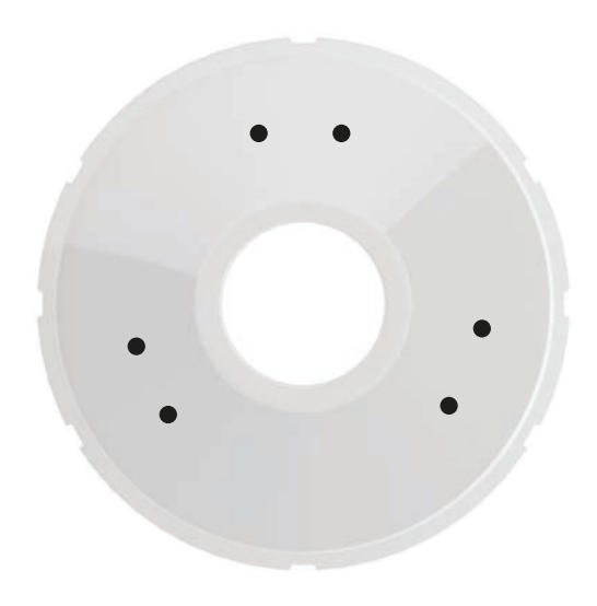
Spoke guard transparent on rear wheel with drum brake 22" and 24"