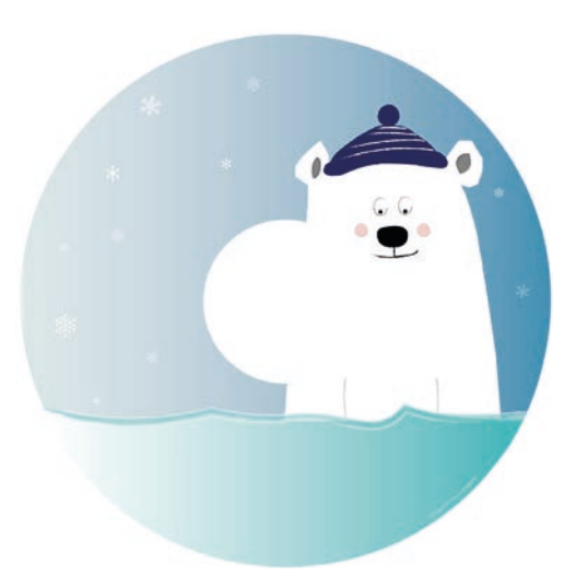
POLAR BEAR HENRY