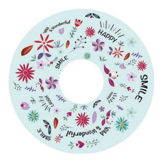
FLOWER POWER TURQUOISE