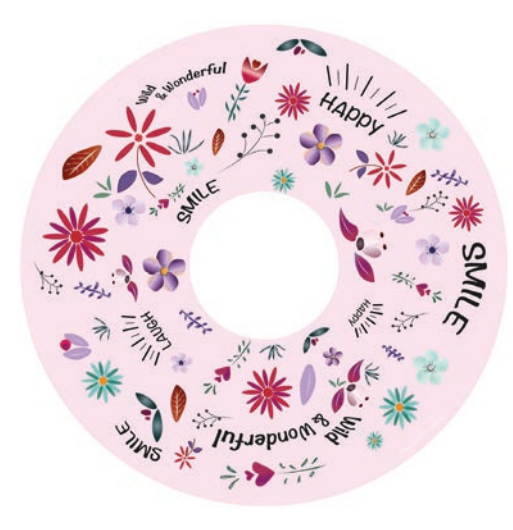
FLOWER POWER PINK