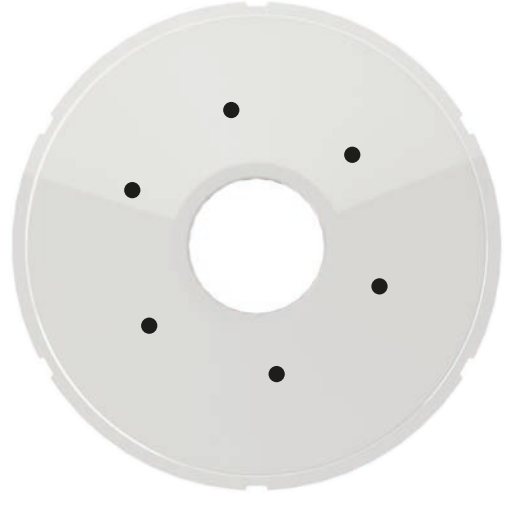
Spoke guard transparent on HOGGI light rear wheel 24"