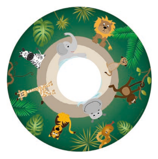
INTO THE JUNGLE