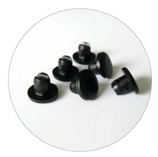
Fastening clips black