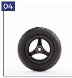
04 Polyurethan front wheel with 6-spoke rims