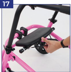
18 Seat folds down