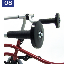
09 Hand disk