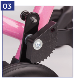
03 Reverse roll lock