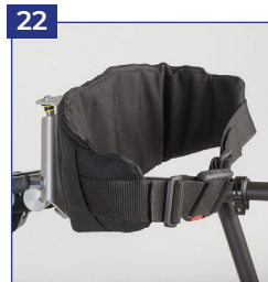
23 Hip belt for dynamic hip control