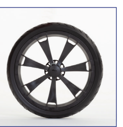
06 Polyurethan rear wheel with 7-spoke rims