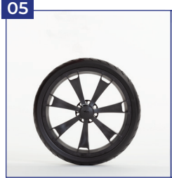
05 Polyurethan front wheel with 7-spoke rims