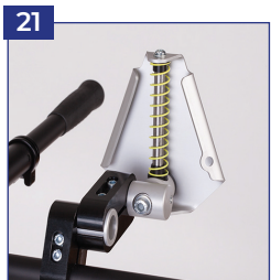
22 Dynamic hip control, suspension soft