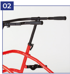
02 Grab rail with universal handle