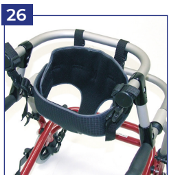
27 Sling seat