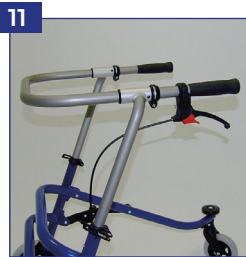
12 Brake with wheel lock