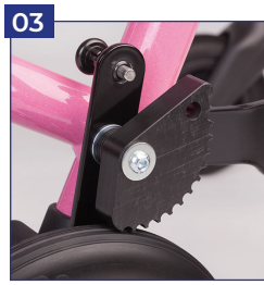
03 Reverse roll lock