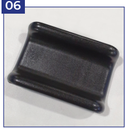
07 Lower arm support