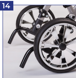
15 Anti-tips, fits to size 4