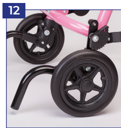
13 Anti-tips, fits to size 1 - 3