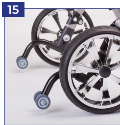
16 Anti-tips with castors fits to size 4