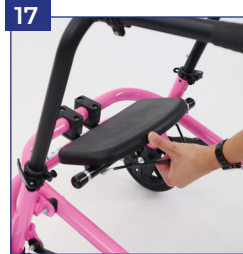
18 Seat folds down