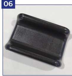
07 Lower arm support