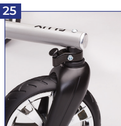
26 Swivel lock