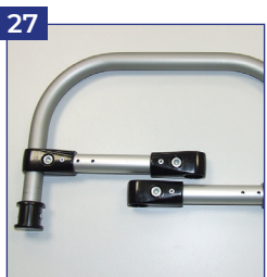
28 Sling seat rail