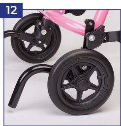
13 Anti-tips, fits to size 1 - 3