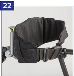
23 Hip belt for dynamic hip control