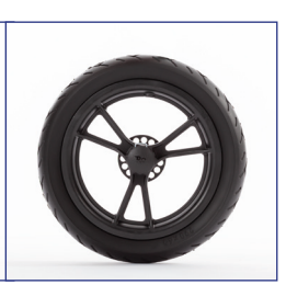
Polyurethan rear wheel with 6-spoke rims