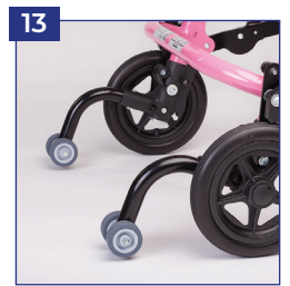
14 Anti-tips with castors, fits to size 1 - 3