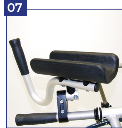
08 Lower arm support