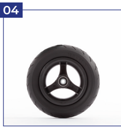
04 Polyurethan front wheel with 6-spoke rims