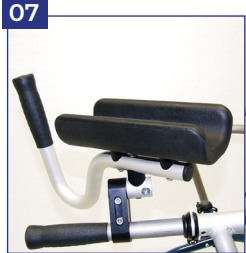
08 Lower arm support