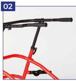
02 Grab rail with universal handle