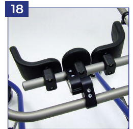
19 Hip-/bottom pads