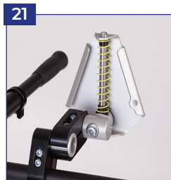
22 Dynamic hip control, suspension soft