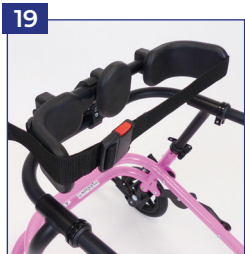
20 Lap belt for Hip-/bottom pads