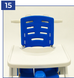
15 Therapy table