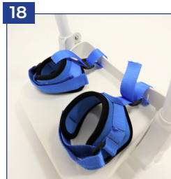
18 Ankle huggers