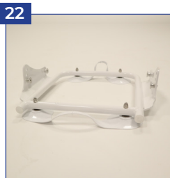
22 Bath subframe