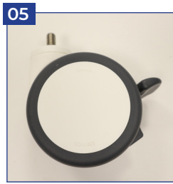
05 Double castors 100 mm