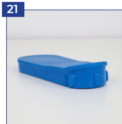
21 PU seat infill pad for hygiene opening