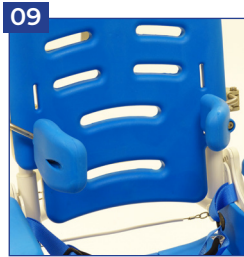
09 Lateral PU pads