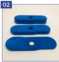
02 PU-hip support pads