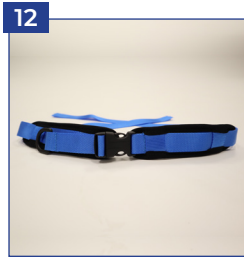
12 Lap belt with neopren pads