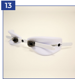
13 A2J Pelvic-retraction belt