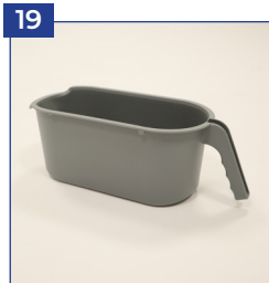
19 Toilet bucket