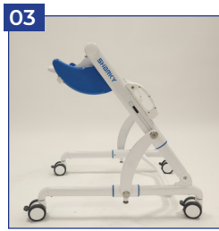
03 Mobility base