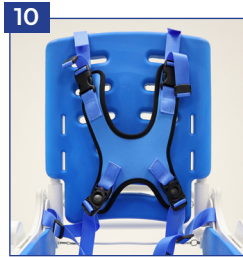
10 Chest-shoulder harness