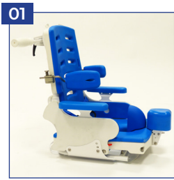
01 Seat unit