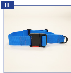
11 Lap belt