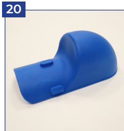
20 Splash guard