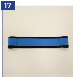
17 Calf support