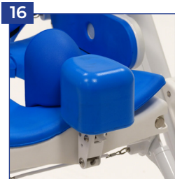
16 Abduction block