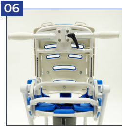
06 Push handle unit