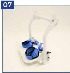
07 Footrest system, angle adjustable