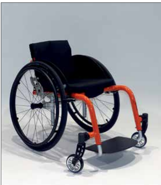
SUPRA / SUPRA light

Detailed product information at: www.hoggi.de