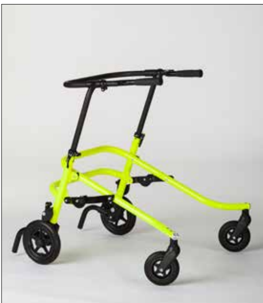
FLUX Gr. 2

Detailed product information at: www.hoggi.de