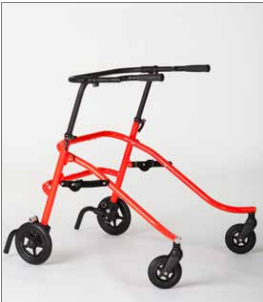
FLUX Gr. 3