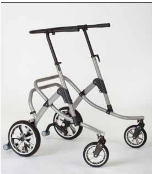
FLUX Gr. 4

Detailed product information at: www.hoggi.de