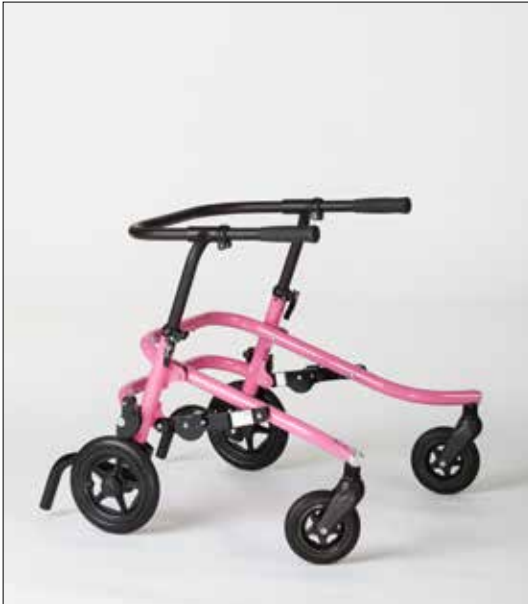
FLUX Gr. 1