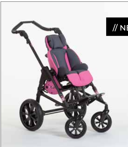
BINGO evolution Mini

Detailed product information at: www.hoggi.de